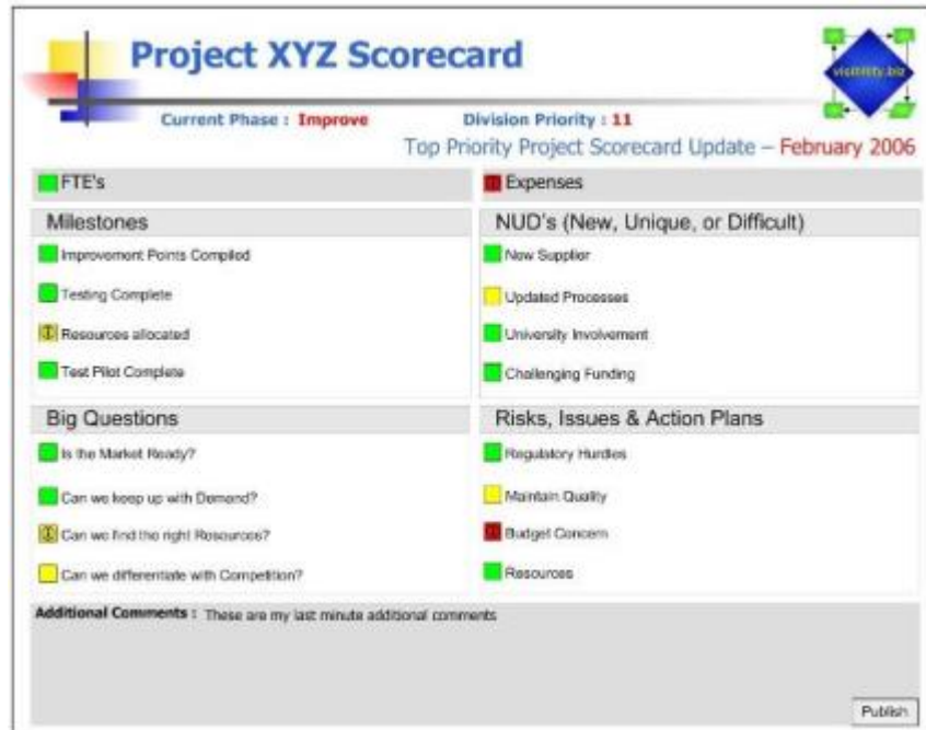
Figure 2. Single, automated Office Visio-Project Professional 2003 scorecard

After generating the scorecard, the project manager selects "Publish" to publish the scorecard to the corporate metrics dashboard Microsoft Office SharePoint® site. Managers have the option to modify the data before doing so. At the end of the month, Stakston uses another Visio template